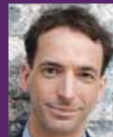
Paul Tough How Children Succeed