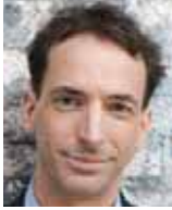
Paul Tough How Children Succeed